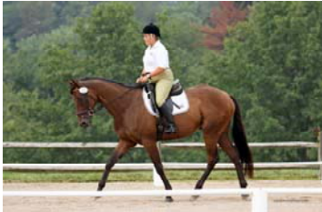
Forbidden aka 'Pip'

It was another busy year of officiating, teaching and running competitions and clinics a Stone Gate Farm but the big difference was that I actually competed a little this year. Pip was a good boy although a little exuberant in the warm at few times. But his steady supple and fluid dressage tests and clean jumping rounds found him being at the top of his divisions 3 out of 4 times. Not bad considering I hadn't competed at all in 2009.