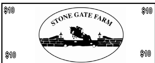
Sample of Stone Gate Farm Bucks

All kidding aside, volunteers are the life blood of our competitions and SGF has a great bunch of volunteers! However we don't want to burn out our volunteers by taking advantage of their generosity so we are always looking for new recruits to spread out the work. We have started a new program where volunteers can earn SGF Bucks which can be redeemed on entries, clinics and stabling. For those volunteers who are the non riders the SGF Bucks may also be redeemed at the food booth and on the upcoming line of logo wear.