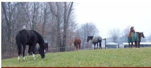
New Pasture near Stabling Barns