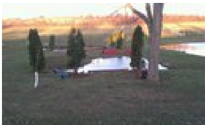
New Landscaping Around the Water

The Winona Horse Trials and Stone Gate Farm will be one of the featured events in the April issue of the USEA News magazine. Be sure to check it out, but as always be sure to check the website, the SGF blog and Facebook for the latest information. We will be posting more pics like the one below to keep you up to date on some of the improvements/