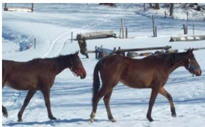
Jack & Jill